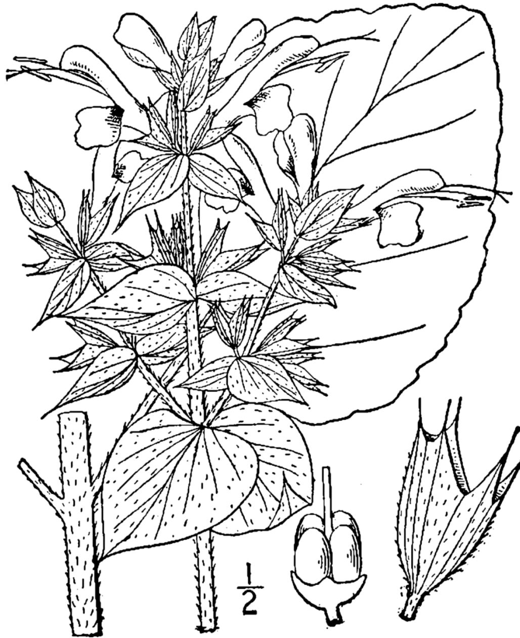
Salvia sclarea L. - Europe sage SASC2