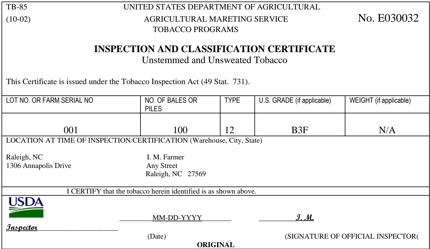
EXHIBIT 2 EXAMPLE ONLY